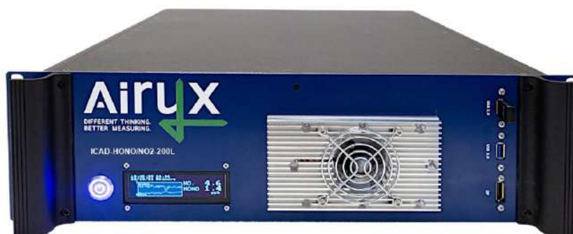
ICAD-HONO/NO2-200L series featuring 19" rack housing and OLED display.

PATENTED, FAST, ACCURATE AND DIRECT NITROUS OXIDE AND NITROGEN DIOXIDE DETECTION