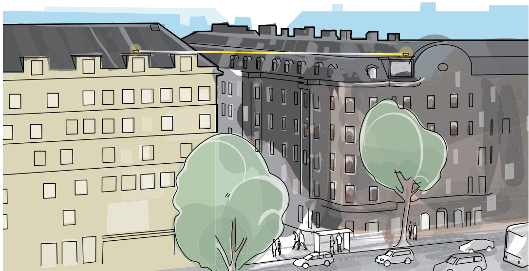
An OPSIS system monitoring the urban air quality

For further information, please visit www.opsis.se .