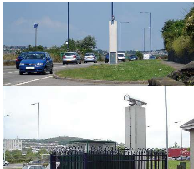
The OPSIS monitoring system is an important tool for continuous environmental control of a range of gaseous compounds at street level

For further information, please visit www.opsis.se .