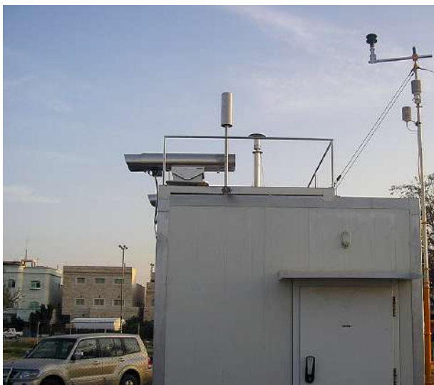
An OPSIS system installed at street level monitoring the urban air quality

The OPSIS system has low cost of ownership based on few moving parts, long intervals between calibrations, easy operation and low energy consumption.