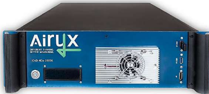
Figure 1 ICAD-NOx-200DL series featuring 19" rack housing and OLED display.

The ICAD ( I terative C avity enhanced D OAS) NO 2 /NO x /NO measurement system uses direct optical absorption spectroscopy in the spectral range between 430 to 465 nm. In contrast to the ICAD 200 series, the "L" series features an enhanced sensitivity by using a longer absorption cell and increased reflectivity mirrors. By measuring the absorption spectrum and applying the ICAD algorithm, the unique and characteristic absorption structure of NO 2 is directly identified and separated from other overlapping absorptions like water vapour (H 2 O) or Glyoxal (C 2 H 2 O 2 ). This gives the advantage of direct NO 2 measurements (in comparison to CLD) without interferences to other substances or the need of drying mechanism which introduce new interferences (e.g., CLD, CRD, CAPS).